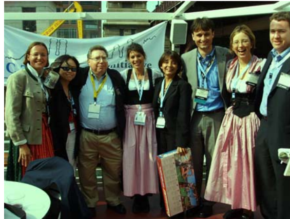
High knowledgeable winners mixed with CTMAI-members.