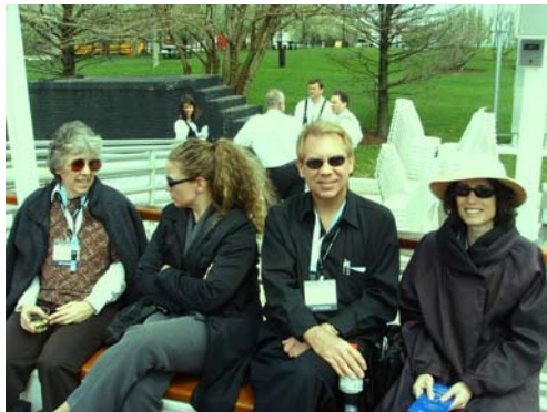
View from the deck of the boat with over 120 guests and participants